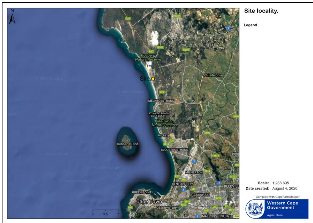
Figure 1: Locality of Koeberg Nuclear Power Station (site).